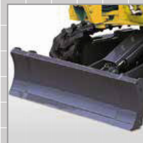
Retractable Blade Extensions